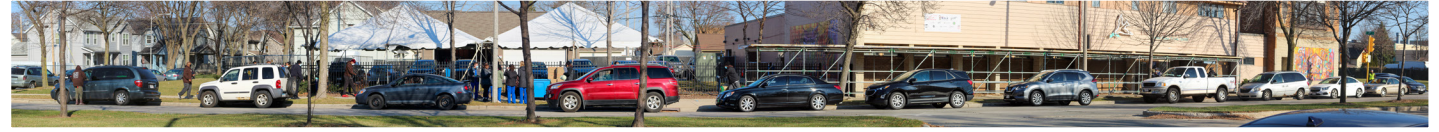
▲ Guests lined up outside to receive Holiday Gift Boxes, Toys and Gift Cards for their families.