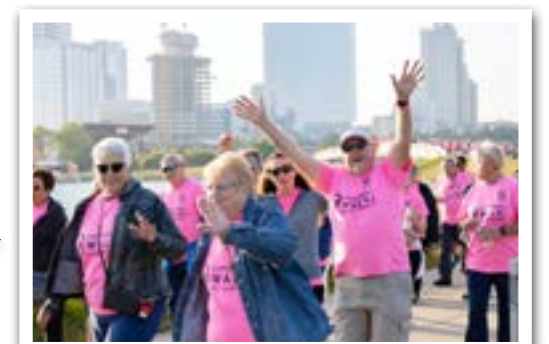
▲Almost 1,000 walkers celebrated the Capuchins' ministry in Milwaukee.