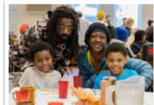
▶ This family enjoyed a fun and healthy Thanksgiving meal.