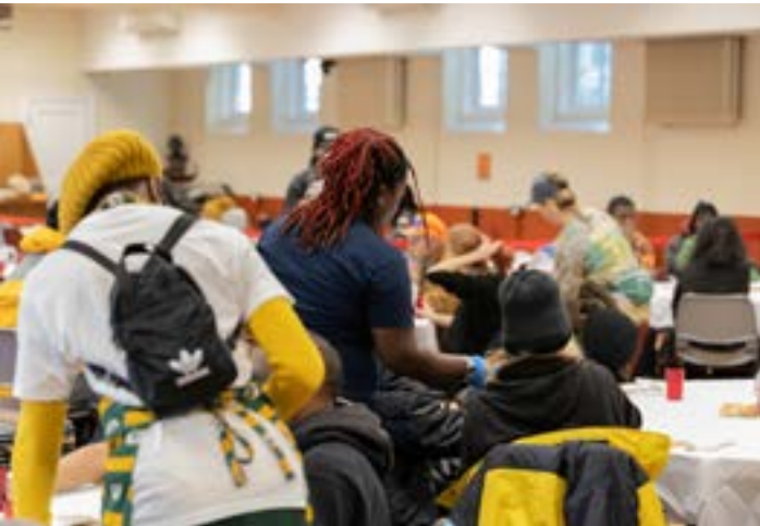
▲ Guests stream into St. Ben's Community Meal hall on Thanksgiving Day to enjoy the feast.