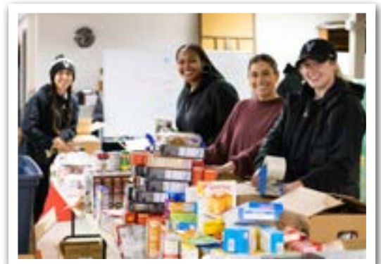
◀ Volunteers from the Milwaukee Bucks help sort and pack holiday food boxes.