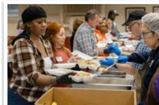
◀ On Thanksgiving we offer table service to the guests. Everyone in this photo is a volunteer, both those filling the plate and those who will serve.