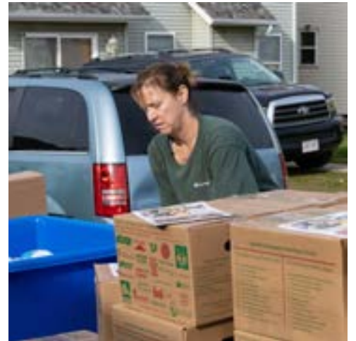
▲ A volunteer picks up a holiday food box to give away.

Our Mission: Inspired by the gospel of Jesus and the example of Francis of Assisi, the Capuchin friars of the Province of Saint Joseph, together with our partners in ministry, prayerfully build sister-brotherhood in the world. We attend simply and directly to spiritual and other basic human needs, especially those of people experiencing poverty and disenfranchisement, promoting justice for all.