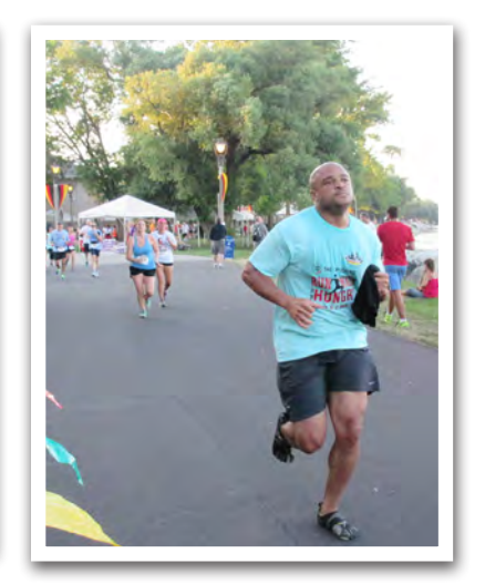
▲ Finish Line: Over 900 people ran the 5K or 3.1 mile course.