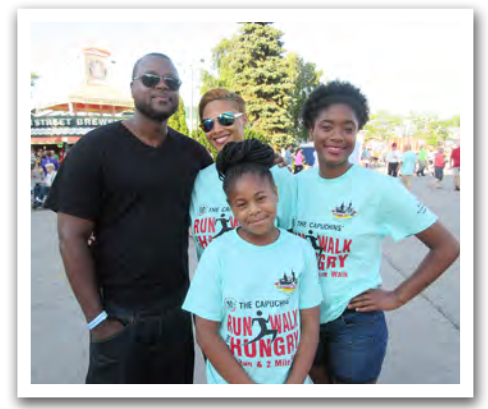
Family Time: Many families enjoyed running and walking to help feed the hungry.