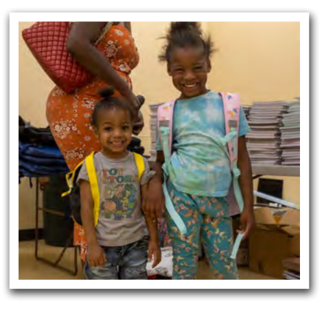
Children beaming with pride as they prepared for the new school year.