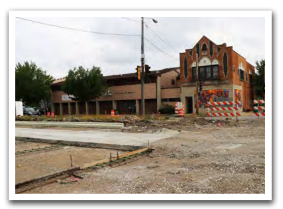
▲ Walnut Street in front of the House of Peace has been torn up & a new roadway is bring poured. Guests & visitors must park on side streets. People picking up food or clothing have to carry those items out.

The City of Milwaukee is replacing Walnut Street from N 12th Street to N 20th Street. This is right in front of the House of Peace. The City's goal is to calm traffic, make the sidewalks ADA compliant and add bike lanes.