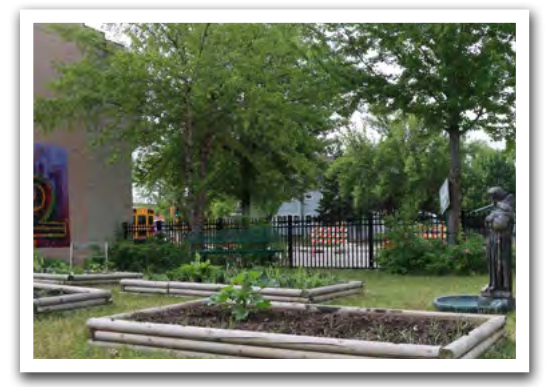
▲ A statue of St. Francis of Assisi looks over some of the planting beds in the Garden of Peace. Guests walk by the Garden to access the House of Peace. Those needing a rest can sit on benches placed on the edge of the gardens.

This will make the House of Peace more accessible but for now access is challenging.