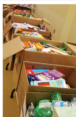
▲ Your gift of school supplies.