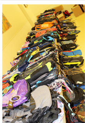
▲ Your gift of backpacks.