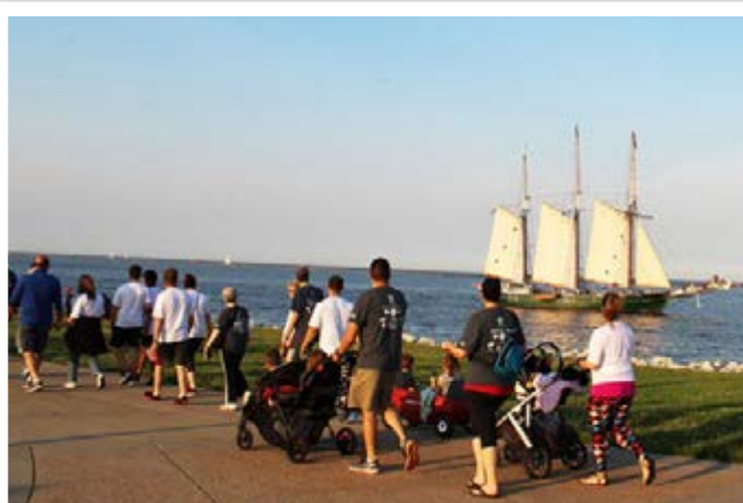
▲ Last year the schooner Denis Sullivan cruised by Lakeshore State Park Island while walkers enjoyed the views. This 19th century three-masted Great Lakes schooner will be in port during the Capuchin Walk for the Hungry on June 14, 2019.