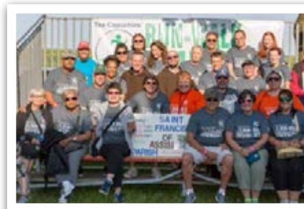
▲ Get to know old friends better while making new friends.