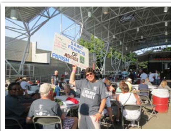
▲ Join or create a team of friends, co-workers, family or worshippers. Meet at the stage, walk as a group & enjoy Polish Fest.