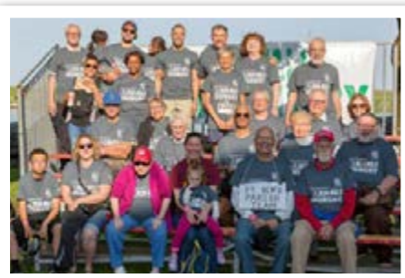
▲ Parish teams enjoy a wonderful night of fellowship. The route and venue is completely ADA compliant. All are welcome!