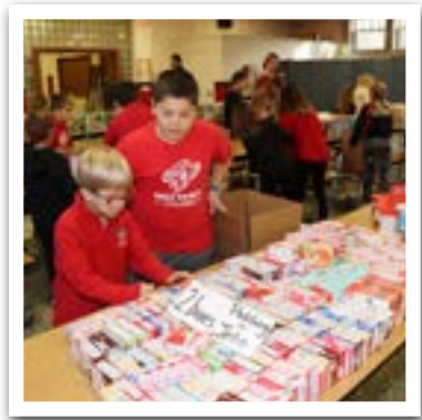
▲ Students at Holy Family Parish School select food to pack holiday boxes for the House of Peace. Many groups helped fill boxes. We had a total of 4,800 returned.