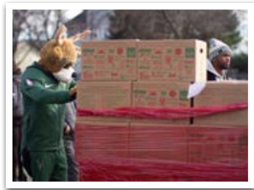
▲ Milwaukee Bucks' mascot, Bango helped push a pallet outside for the Thanksgiving holiday box distribution. Volunteers from the Milwaukee Bucks & Gruber Law Offices helped distribute boxes.