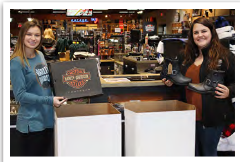
◀ The House of Harley - Davidson donated new & gently used boots.