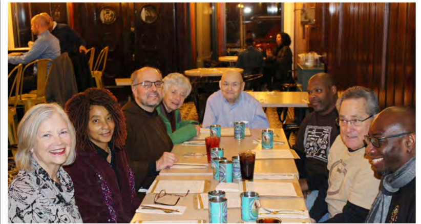
▲ The CCS Ministry Council met for a dinner meeting at a neighborhood cafe. We support our community!