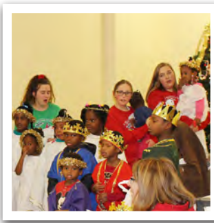
▶ St. Francis Borgia Parish's volunteers put on their annual "Breakfast with Baby Jesus."