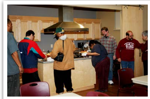
▶ St. Ben's Ministry Council met at the Capuchin Apartments in February and served a meal to the residents. Members of the House of Peace's Ministry Council also participated. Many residents utilize the House of Peace's Food Pantry.

Twice each year HUD asks community groups to count the homeless. This information is used to allocate Federal resources to local communities to care for those living on the street.