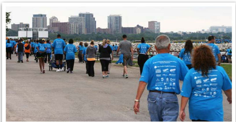
▲ Walkers enjoy the new 2 mile route out the South Gate of Lakefront Festival Park then onto the island. Views of Lake Michigan and the city skyline were visible at every turn.