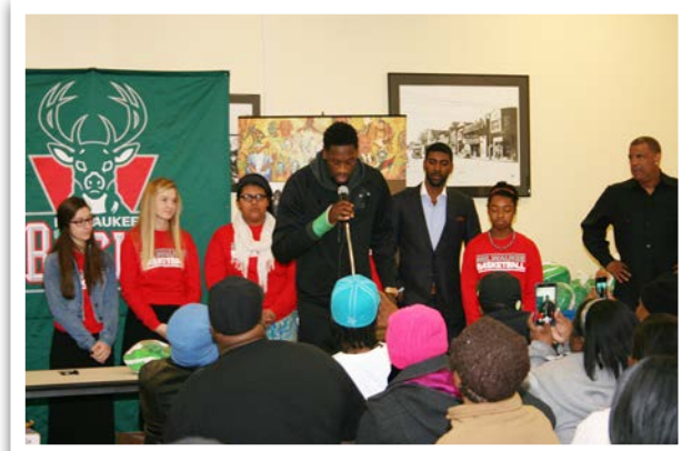
▲ The Milwaukee Bucks' held their annual Thanksgiving Food Box distribution at the House of Peace last year. 150 families received a complete holiday meal with the support of players and staff. Students from local Catholic high schools and the Alverno College Women's Basketball team helped at the event.

See insert for how you can help us feed, clothe and care for those in need.