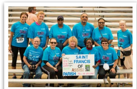
► St. Francis of Assisi Parish put together a team to walk. The House of Peace was founded with the assistance of the parish over 45 years ago.

I was hungry and you gave me food... I was naked and you gave me clothing... (Matthew Chapter 25)