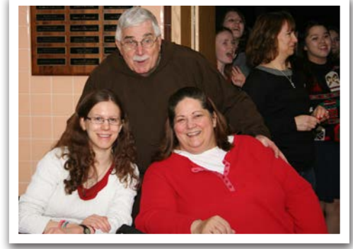
▶ The Quad Parish Youth Ministry of St. Dominic, St. John Vianney, St. Joseph, and St. Mary's Visitation donated toys collected at their annual Winter Dance.