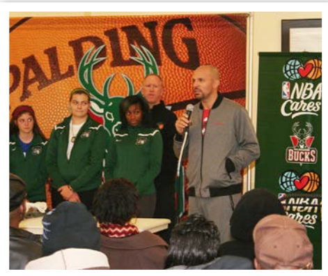
▲ Jason Kidd, Coach, Milwaukee Bucks welcomes everyone. Students from Dominican HS helped distribute boxes.