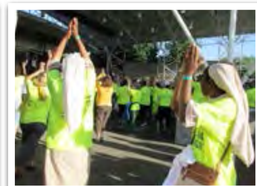
▲ The crowd filled the Johnson Controls Stage before the Run & Walk began for a musical stretch.