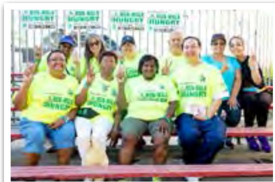
▲ Staff and volunteers from the House of Peace site fielded one of the 52 teams that participated this year.