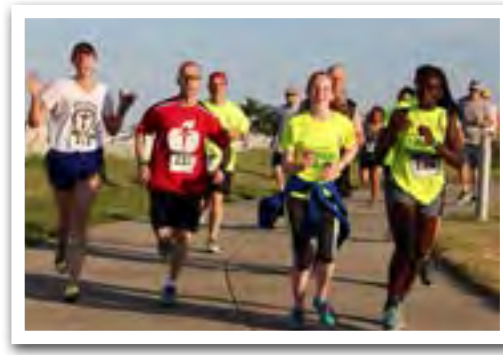
▲ Runners ran a 5K course across Lakeshore Festival Park and around the southern end of the Polish Fest grounds.